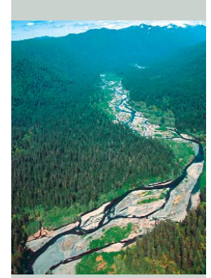
The Hoh's braided channel provides rich habitat for salmon and steelhead.