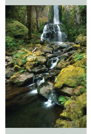
The Kentucky Falls Special Interest Area is one of the largest old growth reserves in the Siuslaw National Forest.