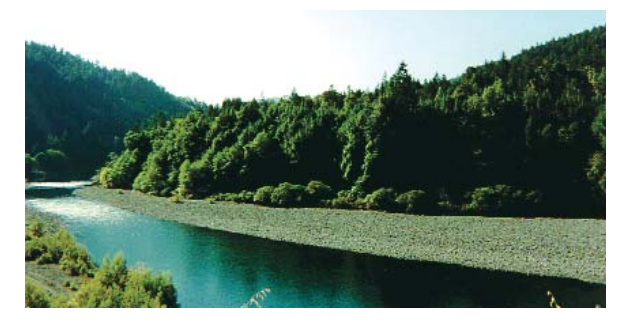
WRC conveyed 871 acres of spectacular trout and salmon habitat be part of a Wild & Scenic River corridor.

The Forest Service's funding for the purchase came from the federal Land & Water Conservation Fund.