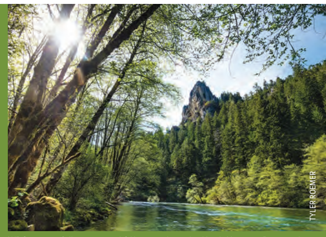
WRC successfully conserved 211 acres along the North Umpqua River and ensured a mile of the North Umpqua Trail will stay public forever.

The Umpqua and Rogue are the only two coastal rivers in Oregon with headwaters in the Cascade Range. All other coastal rivers rise in the lower-elevation Coast Range. Fed by snowmelt, the North Umpqua flows clean and cold year-round, its