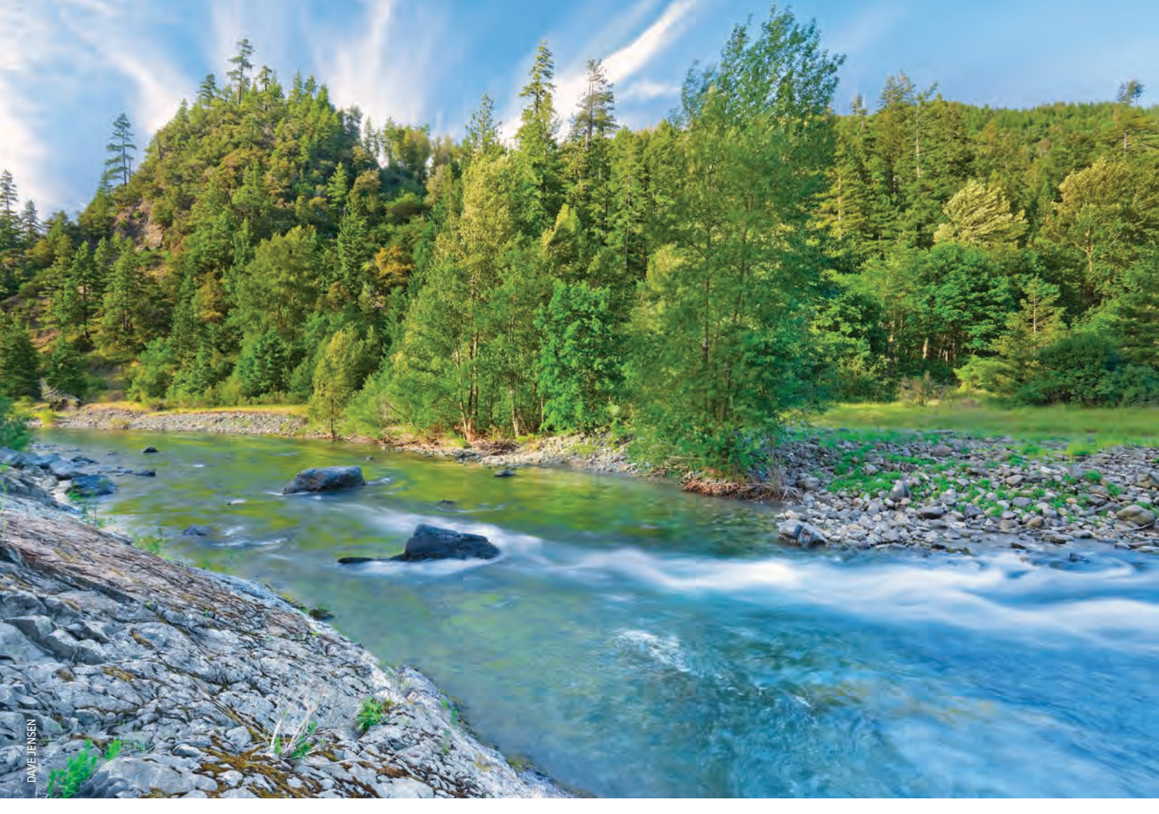
Blue Creek is a critically important source of cold water for the Klamath River, and its health is key to salmon survival and the overall wellbeing of the Klamath-Siskiyou ecoregion.