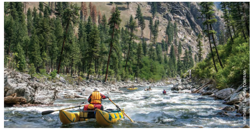
WRC is working to conserve some of the last unprotected riverlands on the South Fork Salmon. The river is a stronghold for cold-water fish, prized by boaters and nearly unmatched for its scenery and remoteness.

The South Fork Salmon River courses through deep, forested granite canyons and is surrounded on all sides by the Payette National Forest and Frank Church/ River of No Return Wilderness. This is