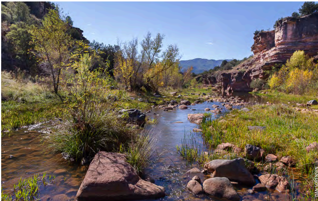
This spring, Western Rivers Conservancy successfully protected Doll Baby Ranch, including a mile of the East Verde River and a crucial recreational access point into Arizona's vast Mazatzal Wilderness.