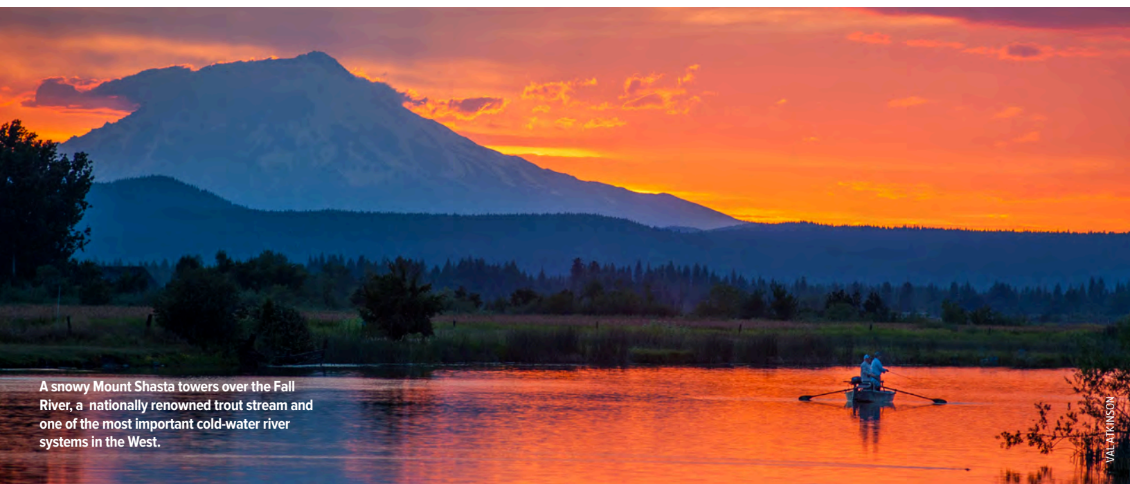
A snowy Mount Shasta towers over the Fall River, a nationally renowned trout stream and one of the most important cold-water river systems in the West.

WRC is currently working with the local community and the Fall River Resource Conservation District to explore ways we might conserve this outstanding property and, if at all possible, create new public access to the Fall River. If we are successful, our efforts will benefit the entire Fall River system, its wild fish, its stunning array of bird life and anyone who has the opportunity visit this one-of-a-kind spring-fed stream. ■