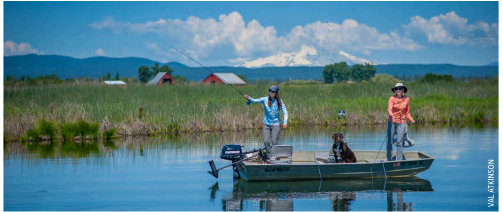
On California's fabled Fall River, two anglers fish a stretch of premier trout water in front of the property that Western Rivers Conservancy is working to protect.

WRC has set out to conserve the 1,158-acre Island Ranch, which is nestled between the Fall River and its two largest tributaries, the Tule and Little Tule rivers. The property adjoins Ahjumawi Lava Springs State Park and the protected McArthur Swamp, and it sits at the heart of the Audubon Society's designated Fall River Valley Important Bird Area. The valley, which is located on the Pacific Flyway, supports a colorful diversity of breeding ducks, shorebirds, raptors and sandhill cranes. Thousands of over-