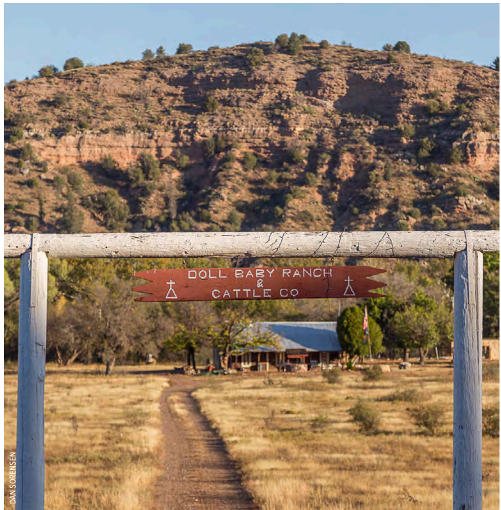
A key access point into the 252,500-acre Mazatzal Wilderness is through Doll Baby Ranch, which WRC forever protected when it transferred the property to the Tonto National Forest this spring.

WRC created Cottonwood Canyon State Park in partnership with OPRD in 2013, and we have long sought to add this adjacent property to improve management at the downstream end. Now that we have, the stage is set for OPRD to enhance a crucial boating access site that anglers, hunters and paddlers rely on for trips down the Wild and Scenic John Day River. ■